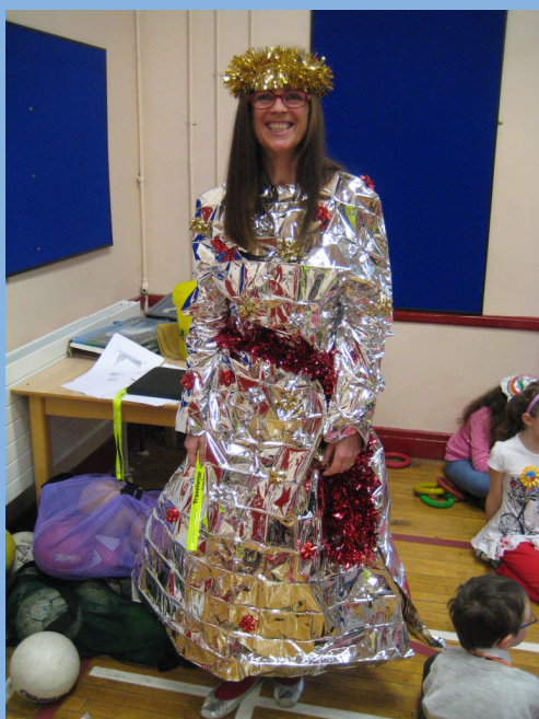
Shiny Superhero Teacher from Carr's Glen Primary School!