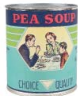
tin of soup