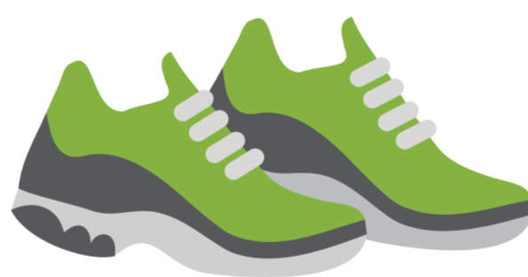
gutties / shune