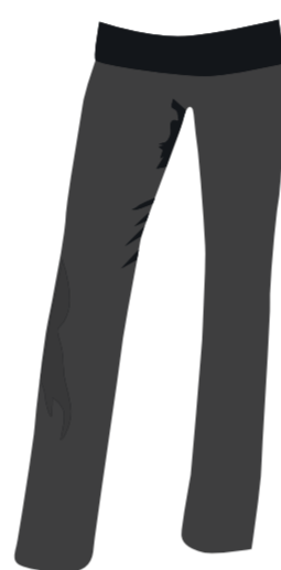
breeks / trews