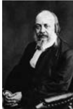
Edwin Chadwick (1800-1890)