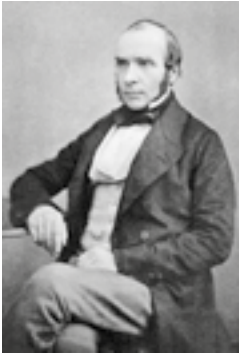
John Snow (1813-1858)