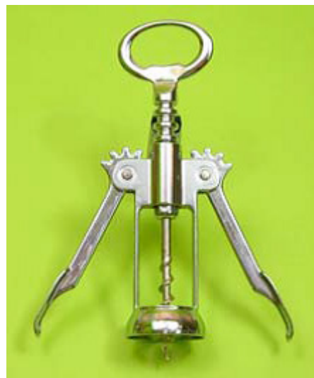
(a) Can opener (b) Corkscrew