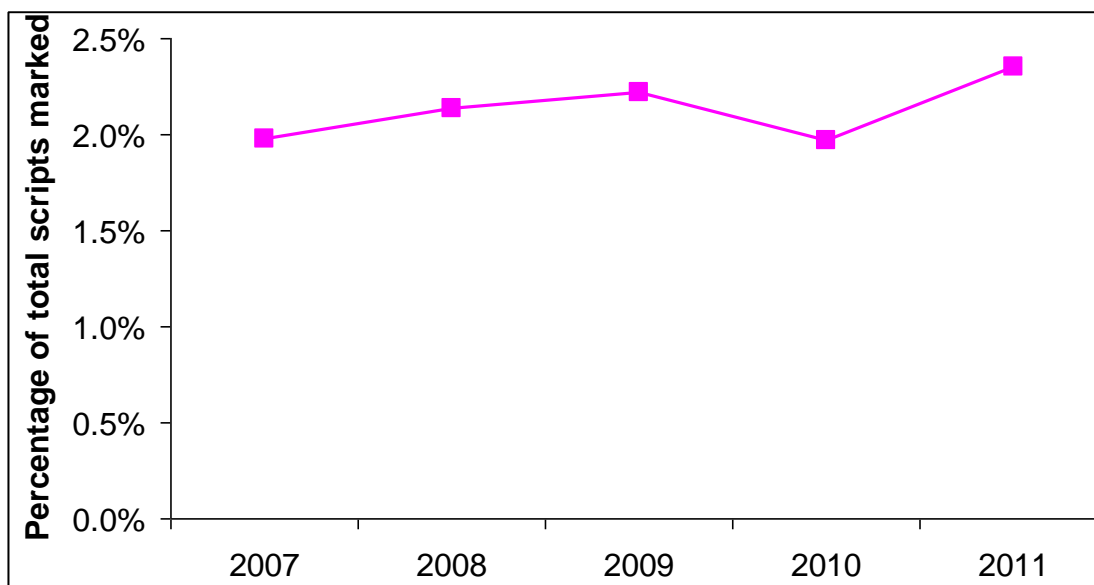
Figure 3: Special considerations as a percentage of total scripts marked, 2007–2011

These figures represent the number of requests for special consideration rather than the number of candidates. This is because an individual candidate may require special consideration for a number of examination papers and is likely to take examinations with more than one awarding organisation for which the same special consideration may be appropriate. Special consideration needs to be requested from each awarding organisation separately.